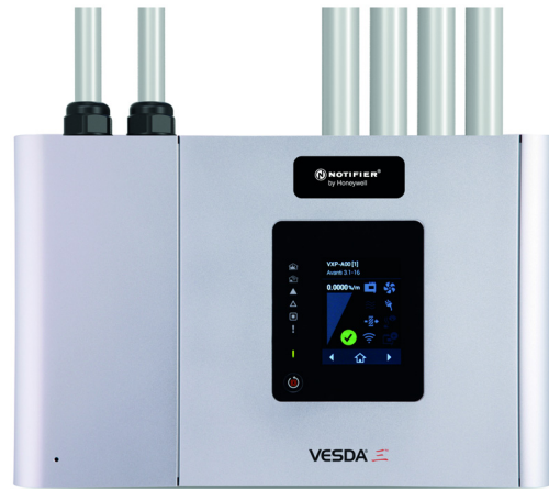
Intelligent VESDA-E VEU-A10-NTF

The Intelligent VESDA-E VEU Series is compatible with existing VESDA installations. The detector occupies the same mounting footprint, pipe, conduit and electrical connector positioning as VESDA VLP.