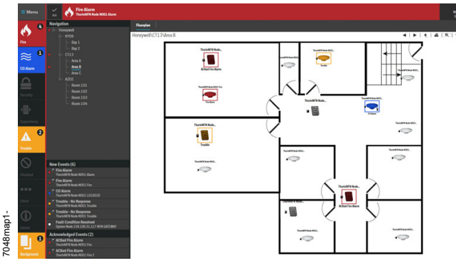
Monitor multiple sites from a single workstation

A single ONYXWorks® Workstation can easily be set up and programmed to monitor multiple sites.